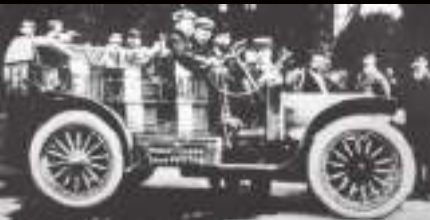
1907, SPYKER 14/18 HP, SPONSORED BY LOUIS VUITTON, IN MOSCOW ON ITS WAY FROM PEKING TO PARIS