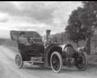
1908. SPYKER 30-42 HP TOURER