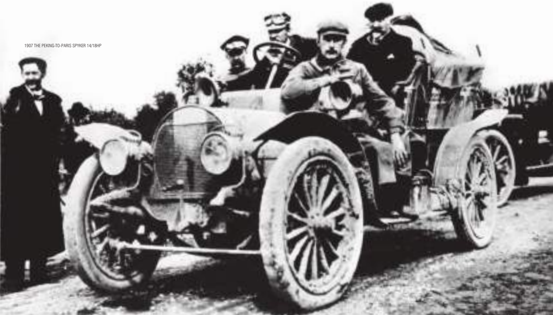
1907 THE PEKING-TO-PARIS SPYKER 14/18HP

In 1925, the Spyker Company ceased trading, but its name was never forgotten. Spyker became an icon, a brand name that stands for technologically advanced, exotic and dependable cars. That heritage has been passed on to the new Spyker and its cars.