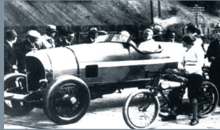
JULY 20, 1922: S.F. EDGE BREAKS THE DOUBLE12 RECORD AT BROOKLAND IN HIS STANDARD SPYKER C4

The Spyker C8 models have fully enclosed undersides, which generates considerable ground effect. Since most race rules prohibit ground effect on GT class race cars the underside of the endurance race model, the Spyker C8 Laviolette GT2R, is entirely flat with no venturiers or diffusers. Instead the GT2R model has a fully adjustable rear wing.