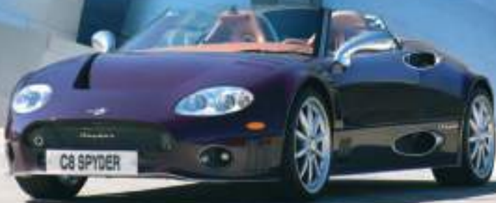
SPYKER C8 SPYDER (CHASSIS NUMBER 093) WALT DISNEY CONCERT HALL LOS ANGELES, CA, USA

The resources to handcraft our cars are very limited and as a result Spykers will never be mass produced. Hence, exclusivity is warranted and owners will experience that wherever they drive or park their cars, making heads turn wherever they go.