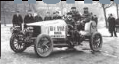
1903, SPYKER 60 HP, THE WORLDS FIRST SIX-CYLINDER FOUR-WHEEL DRIVE CAR

At the dawn of motoring, a Dutch car company was building cars that became a benchmark for their foreign counterparts. Combining technological innovation with a drive for engineering perfection and superb quality, Spyners won gruelling races, set speed records and became known as the most prestigious cars of their time.