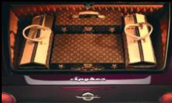
FIVE PIECE LOUIS VUITTON LUGGAGE SET EXCLUSIVELY MADE TO FIT THE SPYKER TRUNK